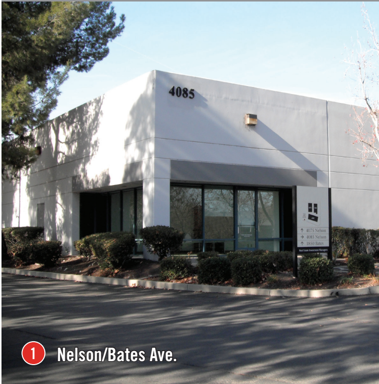
1 Nelson/Bates Ave.