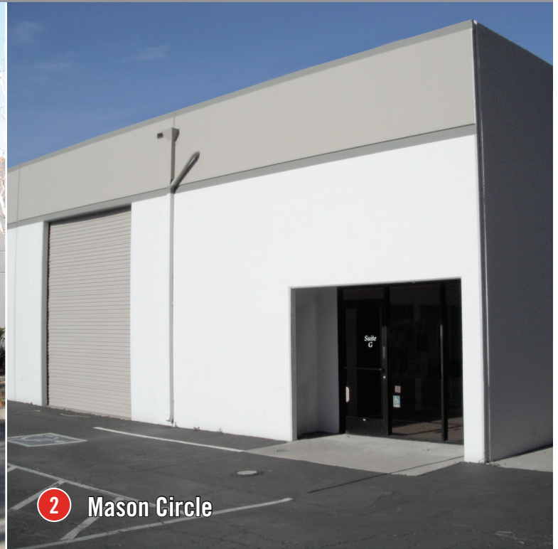
2 Mason Circle